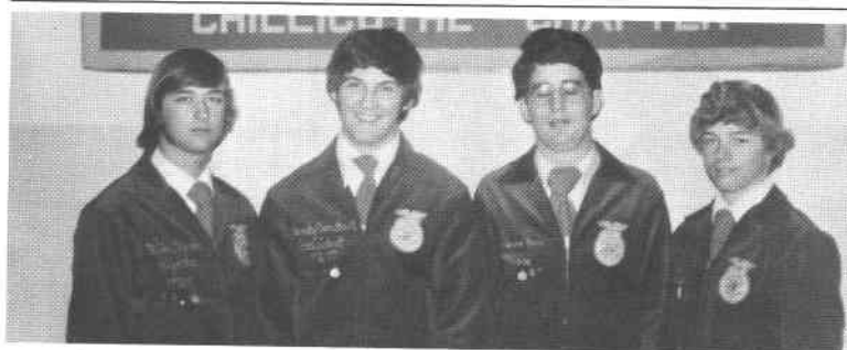
AREA PROFICIENCY AWARD WINNERS