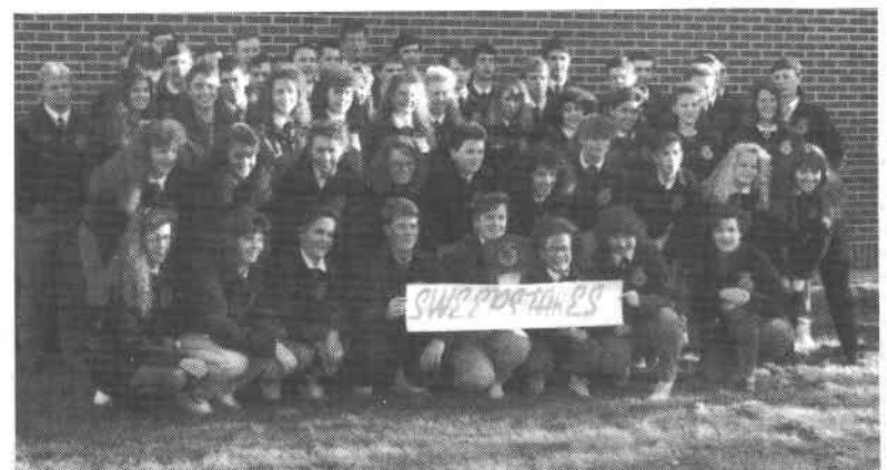
DISTRICT CONTEST SWEEPSTAKES WINNERS - 1990