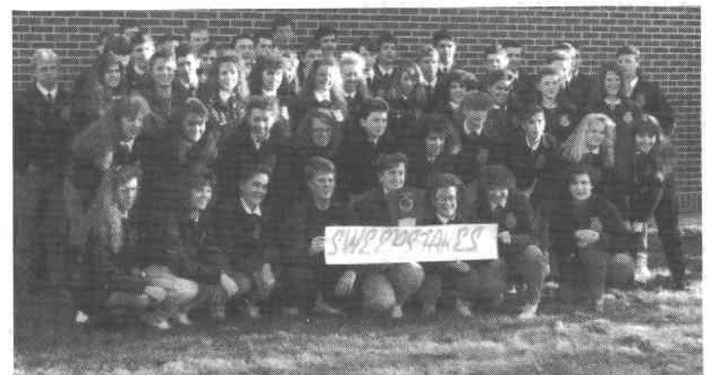
DISTRICT CONTEST SWEEPSTAKES WINNERS - 1990