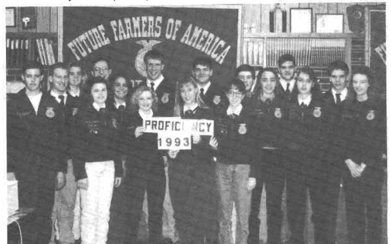
PROFICIENCY AWARD WINNERS